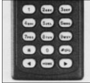
Back-lit 15 button keypad

or manually through operation of a switch. Variable RF power level provides the capability of having up to two power levels in one radio, and of operating in high or low power on a per channel basis. The default power levels in VHF are 5 Watts (high) and 1 Watt (low) and in UHF are 4 Watts (high) and 1 Watt (low). The two power levels can be changed in the field by a service technician if other than the default settings are required.