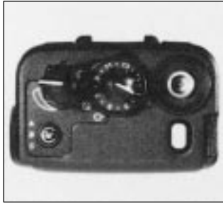
Easy access controls, A7 Model