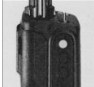
Programmable buttons and switches